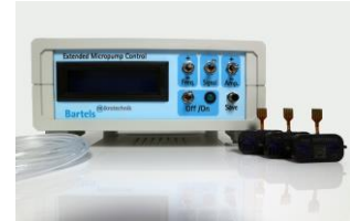
Evaluation kit mp6-go!

Please find all the technical data in our "First information" or on our Website www.micro-components.de .